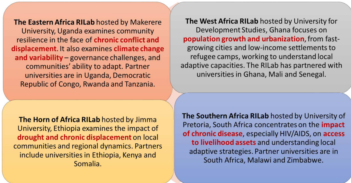
Figure 1: Overview of RILabs and their thematic areas